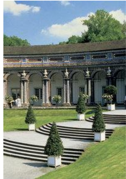
Eremitage in Bayreuth

The first newsletter from the new president ... what a challenge. I decided to introduce you to the region of Germany that I am from – Franconia. Most of you are probably familiar with Nürnberg and its Christkindl's Markt, the dry white wine of Würzburg as well as Bayreuth with the Richard Wagner opera performances. But there is more, you can travel into the mystical world of the Franconian Switzerland in less than an hour. However, my favorite place is the Fichtelgebirge. Untamed nature is a hallmark of the Fichtelgebirge mountains. Mysterious, shadowy forests of beech and pine surprise you time and again with their dramatic rock formations and spellbinding ruins. If you love hiking, mountain biking, and skiing you'll love these myth-enshrouded mountains. Grey granite outcrops are strewn across the land as if placed there by the hand of a giant. A little further on, mountain ridges stretch into the distance and command some breathtaking views. The more you see of the harsh, almost wild landscape, the more you begin to understand why legends of ghosts and magical herbs persist so strongly today. So bringing an eye for flora and fauna, as well as an ear for fable and folklore pays dividends in the Fichtelgebirge mountains. The historic German-German border is not far, cultural events and entertainment are closeby as well as an abundance of castle ruins.