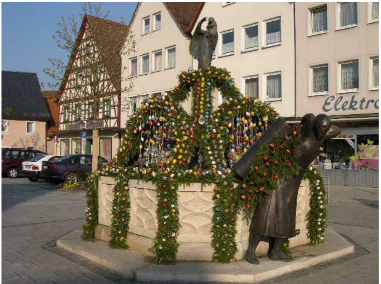
Osterbrunnen in Ebermannstadt For Easter – a decorated fountain in Ebermannstadt