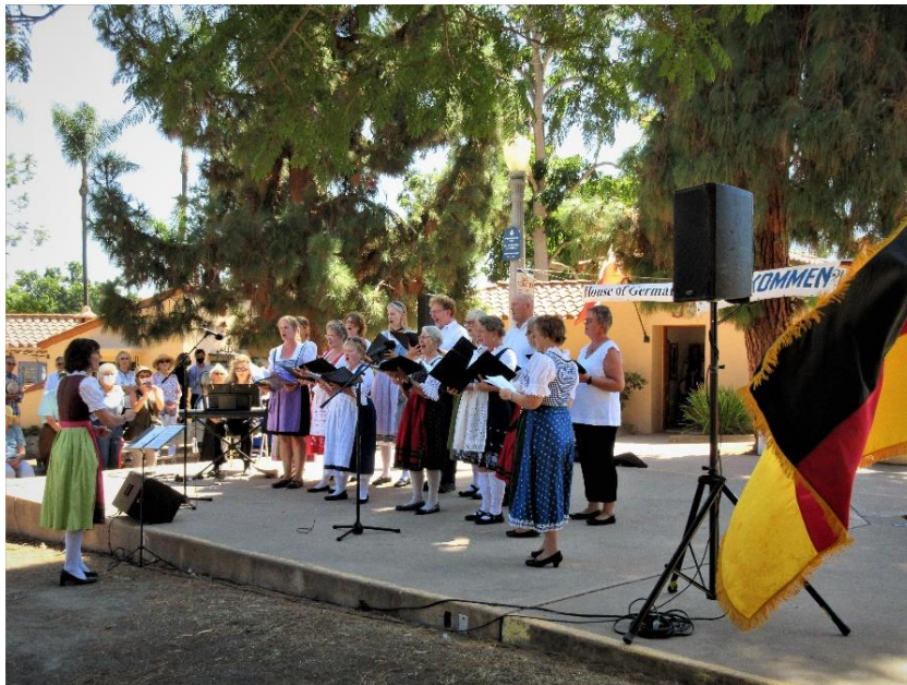
House of Germany Lawn Program 2021