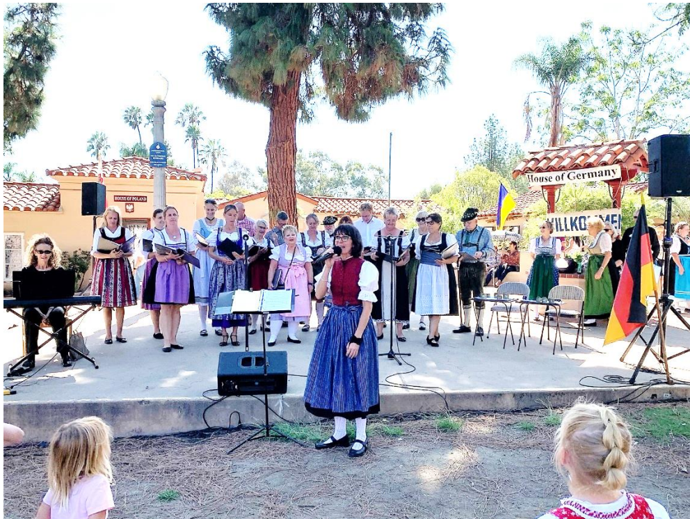
House of Germany Choir at the 2022 Lawn Program