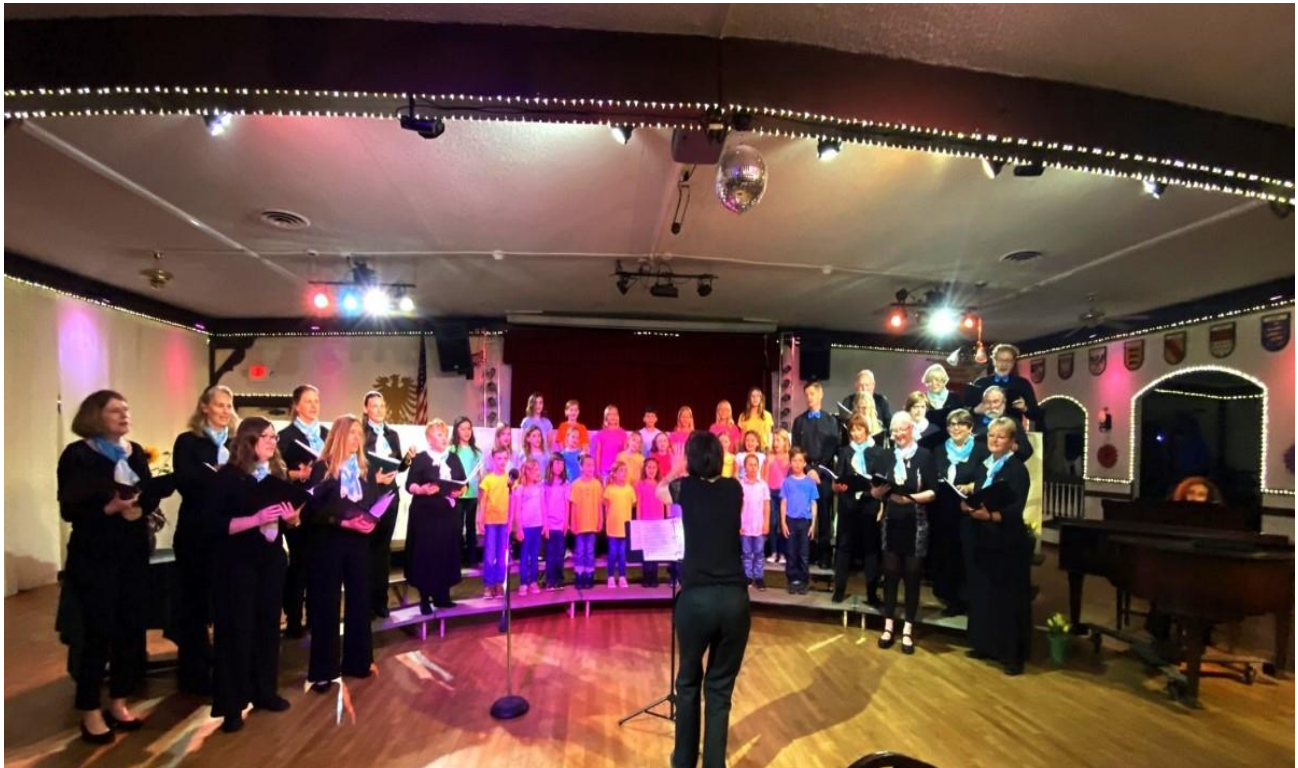
Springfest 2023: House of Germany Choir and Kinderchor