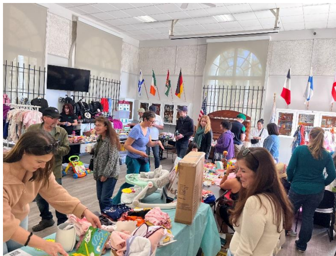
Hall of Nations: House of Germany Flohmarkt

The Kinderwerkstatt Flohmarkt on March 17 th at the Hall of Nations was a big success! Nine House of Germany member families sold their items to an interested audience from the German community in San Diego as well as the public who was visiting Balboa Park that Sunday. Items ranged from baby's and children's clothes, shoes, toys, games, equipment like strollers and bassinets, and of course plenty of books, CDs, and DVDs. The fantastic House of Germany volunteers offered refreshments, coffee, cake, fresh yummy waffles, pretzels, and more. We hope to see you at the next Flohmarkt!