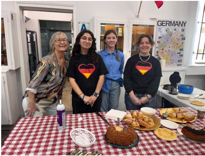
Hall of Nations: Hosting for the Flohmarkt