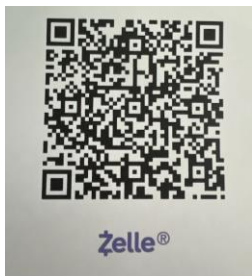
Zelle QR Code